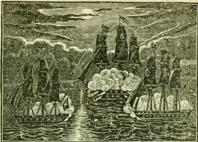
BATTLE OF THE CONSTITUTION WITH THE CYANE AND LEVANT. COMMODORE STEWART.